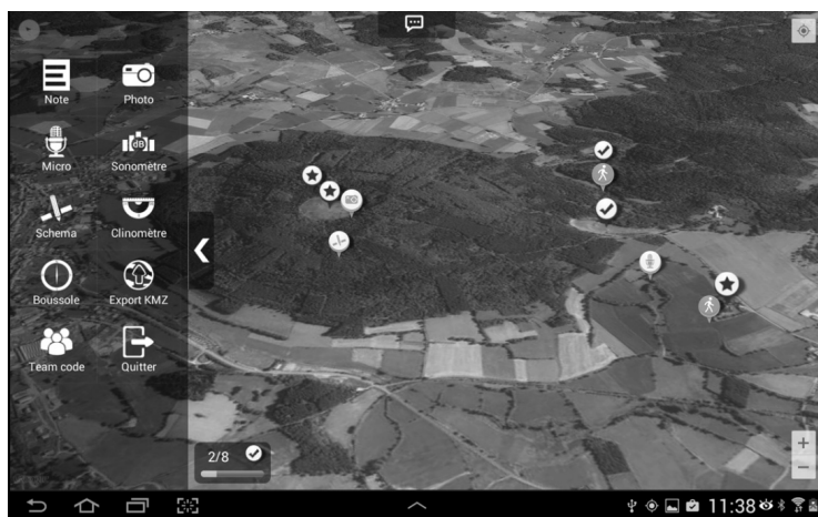
Fig. 1: The Tactileo Map client

Games are complex structures that include rules, storytelling, social interactions, aesthetic and technical considerations. By providing the teachers with the opportunity to achieve such goals, the Tactileo Map is a geomeia dedicated to the ludicization of fieldwork courses.