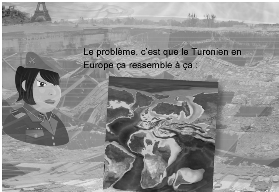
Fig. 2: Geochrono Scouts

Discovering a POI and providing relevant fieldwork interpretation enables students to earn XP points and to fill in the progression bar. Therefore, they can assess the effectiveness of their strategy, and, if needed, modify this strategy. The winning team is the one who can provide the highest number of clues, in a minimum time, for selecting a place above sea level during the Turonian period. The entire class may win as well, as long as a minimum of three teams provide three different clues. As a result, the game is cooperative (i.e. both competitive and collaborative) (NEUMANN et al. 2007).