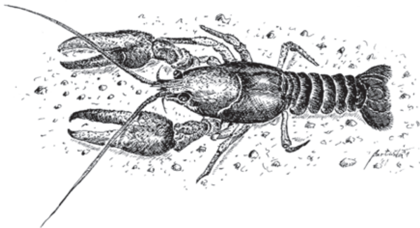
Astacus astacus Graphics by Václav Bartuška