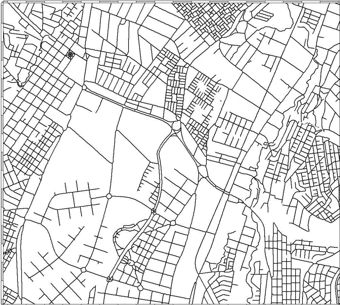
Figure 4 - Example of street centrelines automatically generated from interstitial area (South of Quito).