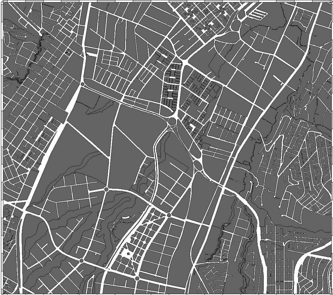
Figure 2 - Example of parcels filled in grey with interstitial areas represented in white (South of Quito).

2. For each square tile, creation of a binary image representing the interstitial area between parcels. A first image is created using a process of polygon rasterisation. This first output image represents the blocks area (figure 2).