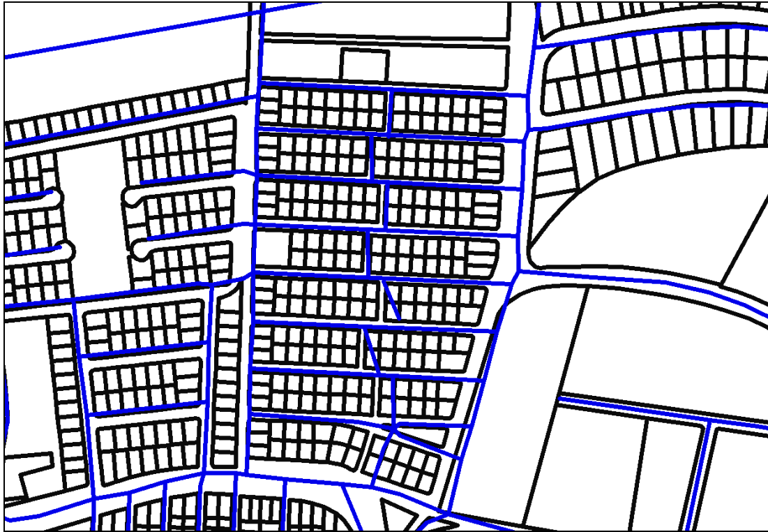
Figure 1 - Example of the bad overlay between the manually digitised streets (ten years old, in blue) and the recently digitised parcels (in black) in the North of Quito.