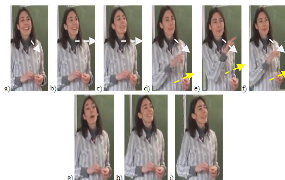
Figure 4: Shift of attention and co-enunciative ubiquity in FL1 context.

While considering the frames, it is important to remember that “no one would dispute the close connection between movements of our eyes and shifts of attention” [41:5], no matter how restricted it may be. Posner [42:26] subdivided attention into three separate but interrelated functions: “(a) orienting to sensory events; (b) detecting signals for focal (conscious) processing, and (c) maintaining a vigilant or alert state”. The first one is of some particular interest for our understanding of the interaction under study. Indeed, Lamargue-Hamel [43:10] explains that orienting to sensory events is implied in the selection and focalization of relevant pieces of information in a given task. Consequently, it is possible to give the teacher's re-orientation of her gaze and head an intentional purpose that serves her pedagogical interest. It also illustrates the ability to divide her auditory attention: she seems to be constantly filtering external stimuli according to their relevance for the current interaction. Additionally, frames d , e and f illustrate the almost simultaneous combined gesture/gaze disjunction. As her gaze comes back to focusing on Pierre she starts a pointing gesture with her right hand indicating Albert at the back of the class. The beat she produces on her deictic gesture (frame e ) informs us about the relevance of his intervention.