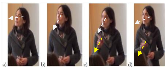
Figure 3: Co-enunciative ubiquity in FL2 context, turns 2-6.

5 | Maria | no right to [use the cellphone] 6 | Omar | XXX