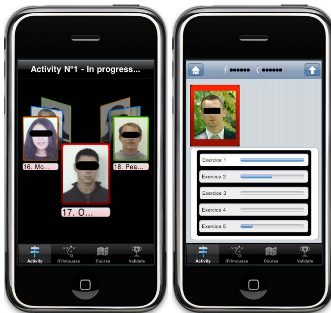
Figure 2. iFrimousse : Mobile application on iPhone/iPod Touch of Apple

return of the ECA after moving, the movement of the dialogue box and the attitude of the ECA. We invite the reader to refer to [3] for more information about this layer.