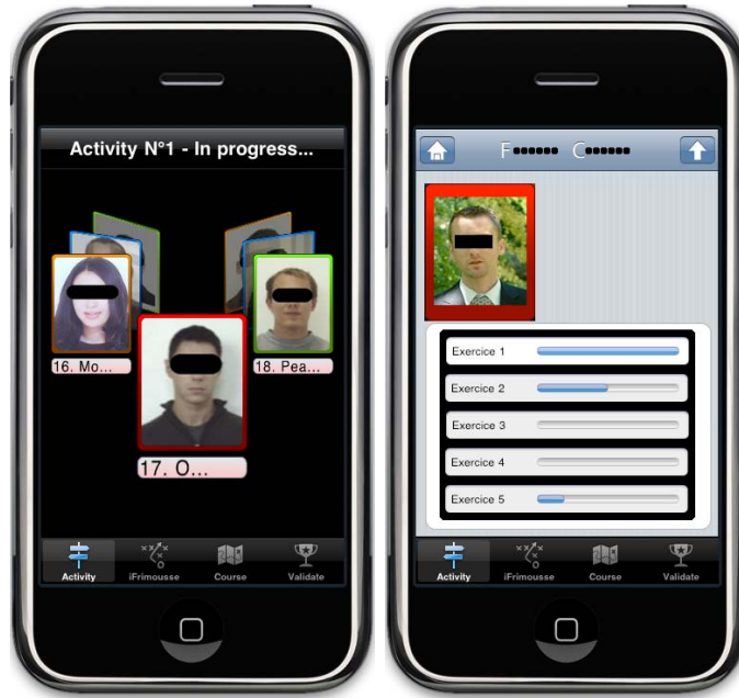
Figure 2. iFrimousse : Mobile application on iPhone/iPod Touch of Apple

return of the ECA after moving, the movement of the dialogue box and the attitude of the ECA. We invite the reader to refer to [3] for more information about this layer.