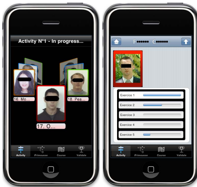
Figure 2. iFrimousse : Mobile application on iPhone/iPod Touch of Apple

return of the ECA after moving, the movement of the dialogue box and the attitude of the ECA. We invite the reader to refer to [3] for more information about this layer.