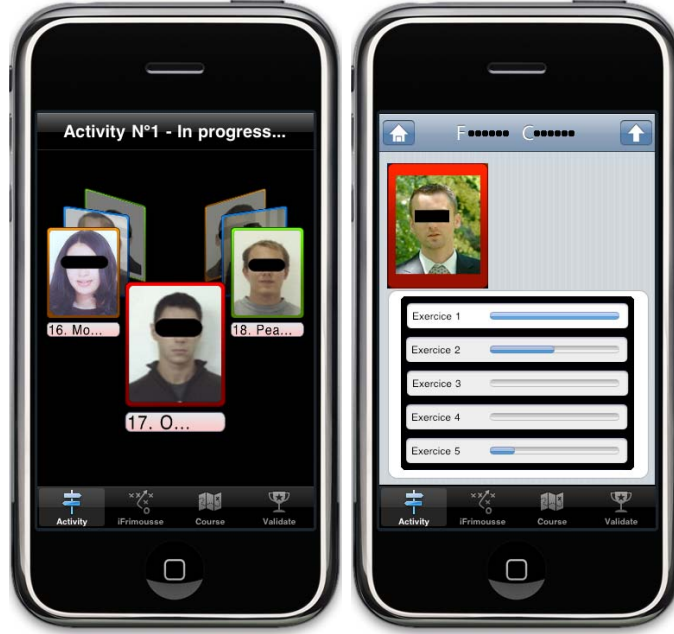
Figure 2. iFrimousse : Mobile application on iPhone/iPod Touch of Apple

return of the ECA after moving, the movement of the dialogue box and the attitude of the ECA. We invite the reader to refer to [3] for more information about this layer.