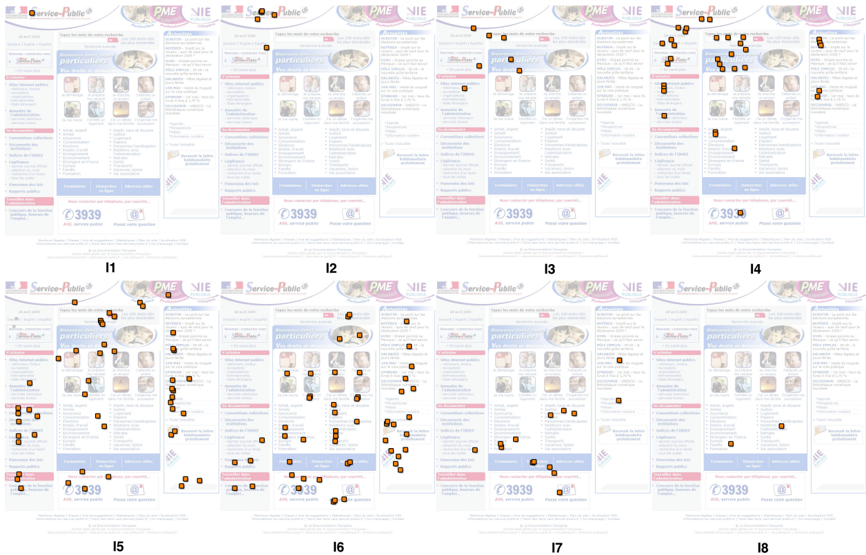
Figure 4. Locations retrieved by the space-time mean-shift during the experiment