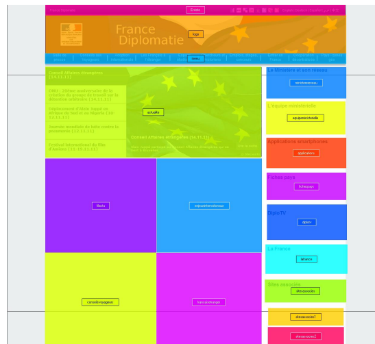
Figure 2. An example of AOIs on a webpage (partial view).

Some visualization methods have been proposed to improve the level of details of AOIs based data analysis. The parallel scanpath visualization, for example, allows visualizing many individuals on a single screen in a parallel layout (Raschke et al., 2012). Another approach is based on the representation of scanpaths in a (3D) Space Time Cube (Li et al., 2010). However, these interesting methods seem not to be very readable with large number of scanpaths.