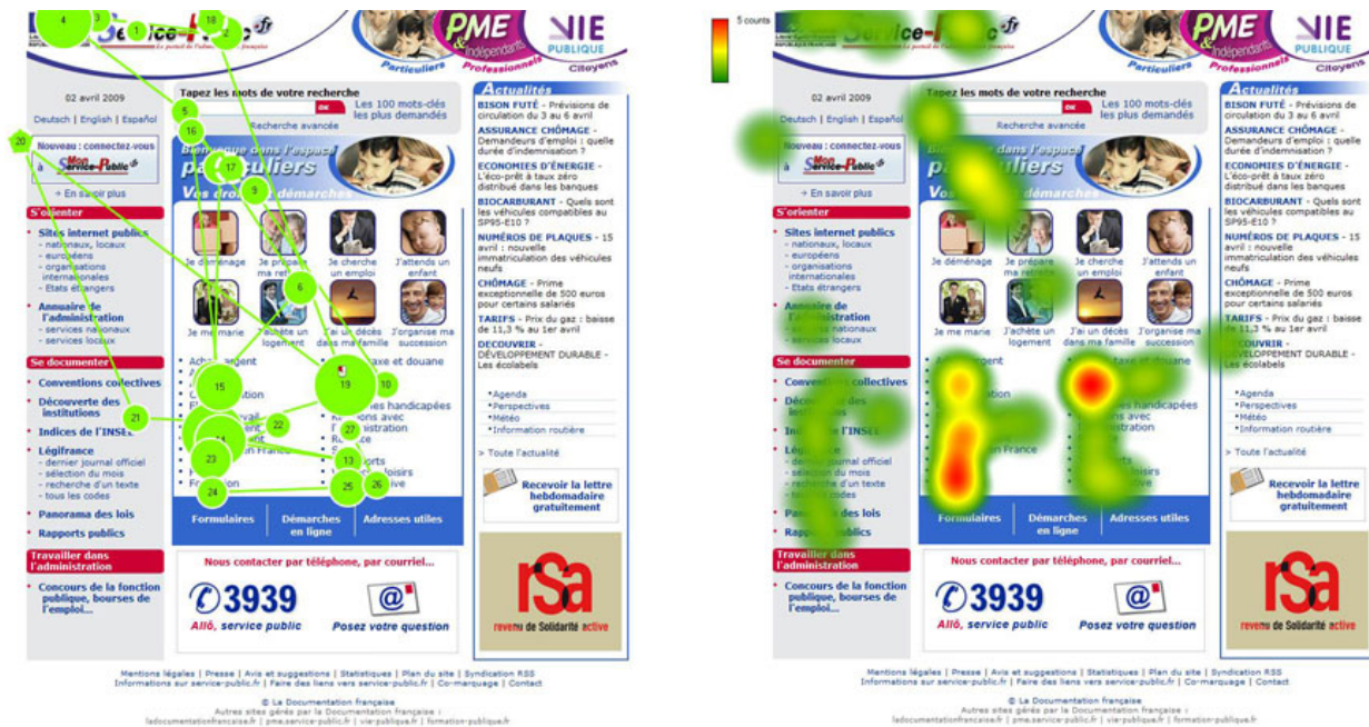
Figure 1. A gazeplot (left) and a heatmap (right) of one participant.