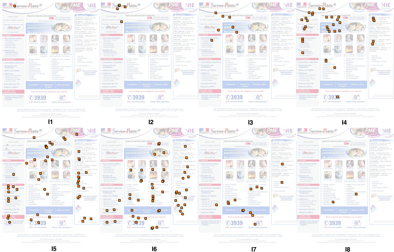
Figure 4. Locations retrieved by the space-time mean-shift during the experiment