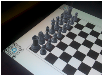
Figure 2: Virtual chess pieces are placed upon detection of at least one of the target QRCode.