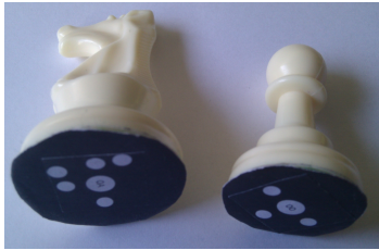
Figure 1: Markers attached underneath a knight and a pawn chess pieces.