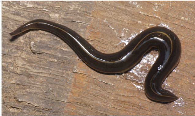
Figure 1 Platydemus manokwari de Beauchamp, 1963. Specimen collected in a hothouse, Caen, France. Dorsal view: note median longitudinal line.