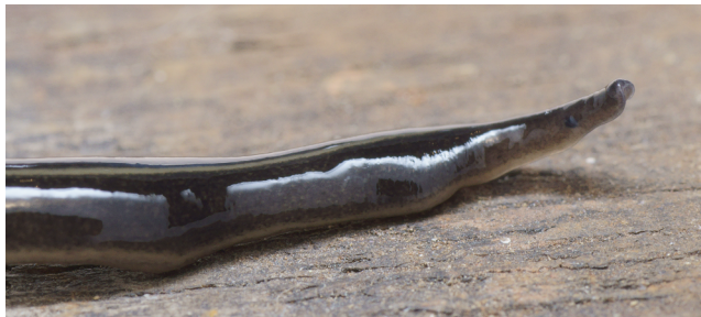
Figure 2 Platydemus manokwari de Beauchamp, 1963. Detail of head, lateral view, showing one of the two slightly protuberant eyes.