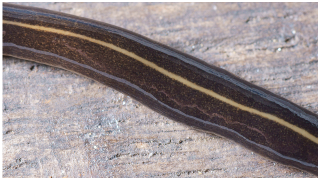
Figure 3 Platydemus manokwari de Beauchamp, 1963. Detail of body, dorsal view, showing pale cream median longitudinal stripe on dark olive brown background.