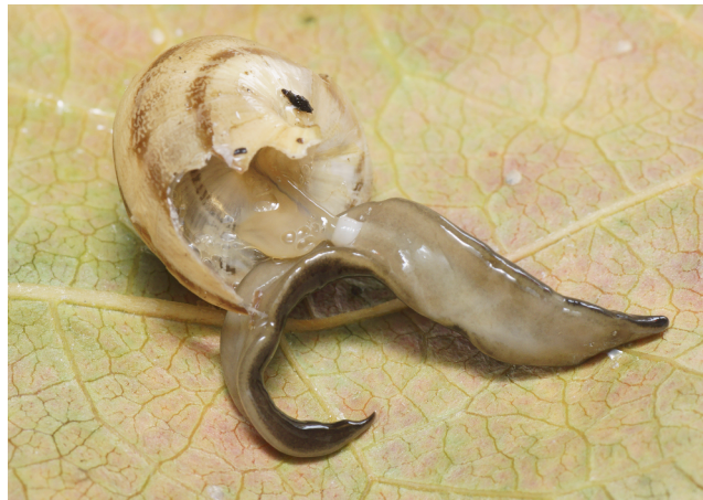
Figure 5 Platydemus manokwari de Beauchamp, 1963, experimental predation on indigenous snail. The flatworm is preying on a snail: it has been disturbed, thus showing the white cylindrical pharynx on the ventral side, protruding and ingesting soft tissues of the snail. The prey is the helicid Eobania vermiculata , a common snail of the Mediterranean region.

Although this is not mentioned in the GenBank record, we know that this specimen was collected in Australia by one of us (LW). The population from which the GenBank example of Platydemus manokwari ( AF178320.1 ) was taken had previously been confirmed histologically (by LW from lot LW1065) as P. manokwari and voucher specimens lodged in the Queensland Museum (Registration numbers GL4724, whole specimen in alcohol, and GL4725, 126 slides).