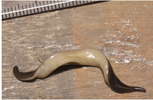
Figure 4 Platydemus manokwari de Beauchamp, 1963. Partial ventral view, showing the cream and faint grey marginal stripe, and the creeping sole that is slightly paler along the median line. Scale: millimeters.