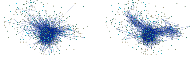
Fig. 3. Drawings of samples obtained with the complete (left) and tbfc-complete (right) strategies after the 20 000 link queries. The position of the nodes is the same in the two drawings (it is obtained by a classical graph drawing algorithm ran on the actual network), which makes it possible to observe visually that the links discovered by each strategy are not the same.

Until now, we focused on our ability to discover many links with as few link queries as possible. However, different strategies discover different links, which may have consequences on the properties of the obtained samples: they may be biased by the measurement strategy, and biased differently depending on the strategy we use. This can be observed visually in Figure 3 for instance, and confirmed by the statistics given in Table II.