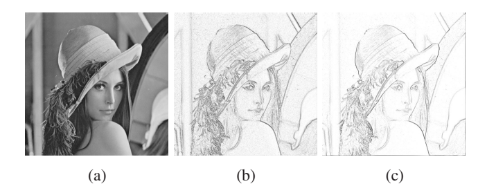
Fig. 1 : (a) Lena image, (b) in gray, pixels where intensity value may be fixed during \alpha -expansion (multiplied by 4), (c) fixed pixels during \beta -jump (multiplied by 2).