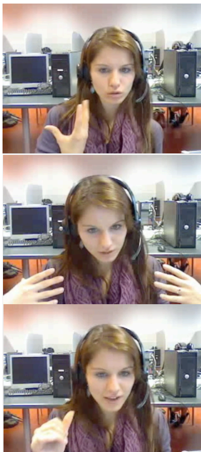
Figures 4, 5 and 6

ALE [the] hum (inaud.) in the: (0.6) the break/ (.) for coffee/ and ((laughs)) x (0.5) [and drink] a glass MEL [°ok\^] (1.6) ok