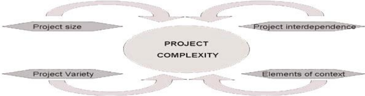
Figure 1. Drivers of project complexity

After a literature review on project management and project complexity (Baccarini, 1996), (Sinha and al., 2001), (Marle, 2002), (AFNOR), (IPMA, 2006 b), (Laurikkala and al., 2001), (Aissa, 2004) etc., we do argue that project complexity can be characterized through some factors that can be classified into four families (see Figure 1). All are necessary but non-sufficient conditions for project complexity. The first family encompasses project size factors. The second one gathers factors of project variety. The third one gathers those that are relative to the interdependencies and interrelations within the project system. Finally, the fourth one deals with project complexity context-dependence. In this section, we give a few words about them and then build a new project complexity framework according to this classification.