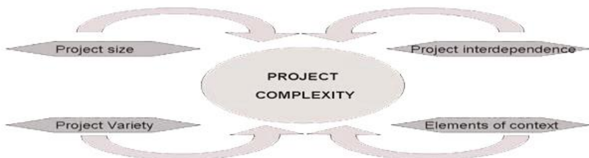
Figure 1. Drivers of project complexity

After a literature review on project management and project complexity (Baccarini, 1996), (Sinha and al., 2001), (Marle, 2002), (AFNOR), (IPMA, 2006 b), (Laurikkala and al., 2001), (Aissa, 2004) etc., we do argue that project complexity can be characterized through some factors that can be classified into four families (see Figure 1). All are necessary but non-sufficient conditions for project complexity. The first family encompasses project size factors. The second one gathers factors of project variety. The third one gathers those that are relative to the interdependencies and interrelations within the project system. Finally, the fourth one deals with project complexity context-dependence. In this section, we give a few words about them and then build a new project complexity framework according to this classification.