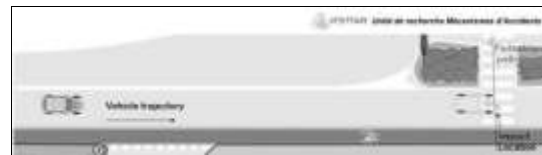
Figure 1 Scheme illustrating the crash scenario

To show the possibilities of this assessment method, an accident case has been selected.