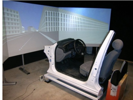
Fig. 1. Driving simulator.

space traffic) and on the 3D SIM2 loop of visualization. The interactive driving station comprised one quarter of a vehicle including a seat, a dashboard, and controls equipped with captors, i.e. pedals and steering wheel (see Fig. 1).