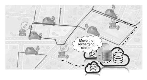
Figure 5: Optimising battery recharging.

Part of the objective of taxi companies is use only electric vehicles. Unfortunately the lack of data makes it complicated to make good strategic solutions on the locations of the recharging stations that are also mobile (Figure 5).