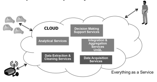
Figure 1: Big Data as a Service.

In order to let these services work in the best conditions, it is necessary to propose an approach for integrating and aggregating collected data and correlate it with data streaming from other data providers. Indeed, data must be cleaned to complete them and remove heterogeneity and then prepared (stored on disk, memory or cache) to support decision-making actions. This paper proposes a data store as a service that is a horizontal support for the services described in the previous lines.