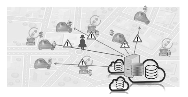
Figure 4: Disseminating exceptional events.

The applications deployed in taxis and users can be used for disseminating exceptional situation events, for example, unexpected dangers (Figure 4). In our scenario a pedestrian is about to cross the road. "Vehicle A" is arriving in the same place but has no line of sight. "Vehicle B" in the area "sees" the pedestrian. The video stream from "Vehicle B" is analysed by the "Information extraction and cleaning services" and compared with topological information of the area. The pedestrian detection information is stored on a NoSQL database. As the vehicle comes in the area, the vehicle computer will make query to that database informing on potential dangers and then notifies the driver of the danger.