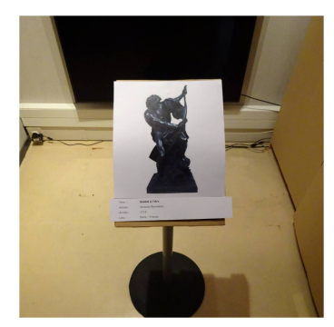
Fig. 2. The 'statue' between the agent and the user.