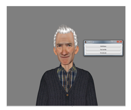
Fig. 3. Leonard and the keywords that are needed to talk with it.