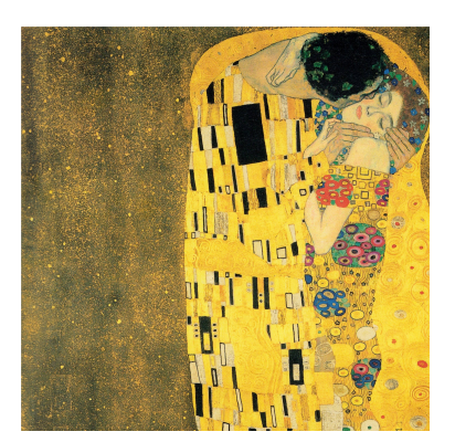
(d) The Kiss – Gustav Klimt