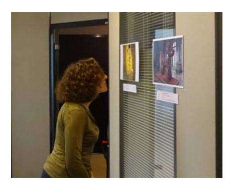
Fig. 1. The improvised museum.

one by one to visit a small improvised museum, talk with a virtual agent called Leonard, and fill in a questionnaire. Below we briefly discuss each of these steps.