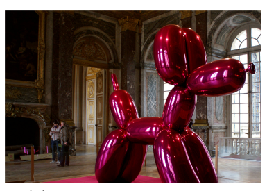
(b) Balloon Dog – Jeff Koons