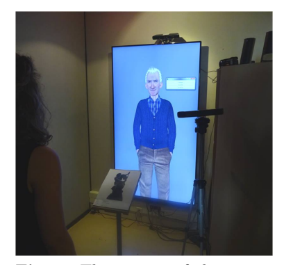
Fig. 4. The setting of the interaction.

When the participant entered the room Leonard started the interaction. Leonard has the appearance of a cartoon-like version of a man of about 70 years old, is displayed on a 75-inch vertically placed screen, and speaks French. The user was recorded with two kinects and one camera (Fig. 2).