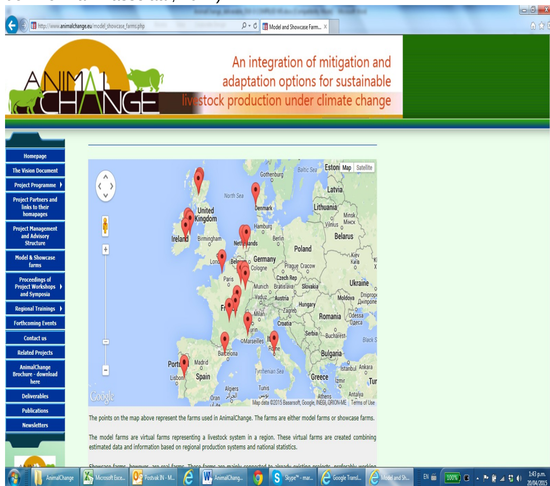
Figure 6.1. European model farms and showcase farms of AnimalChange. Source: http://www.animalchange.eu/model_showcase_farms.php

In total ten different adaptation measures were identified by the local experts from Europe as best adaptation measures for their farms. These measures are listed in Table 6.2. The definition of the measures has been described in Deliverable 8.1 (van den Pol–van Dasselaar, 2012).