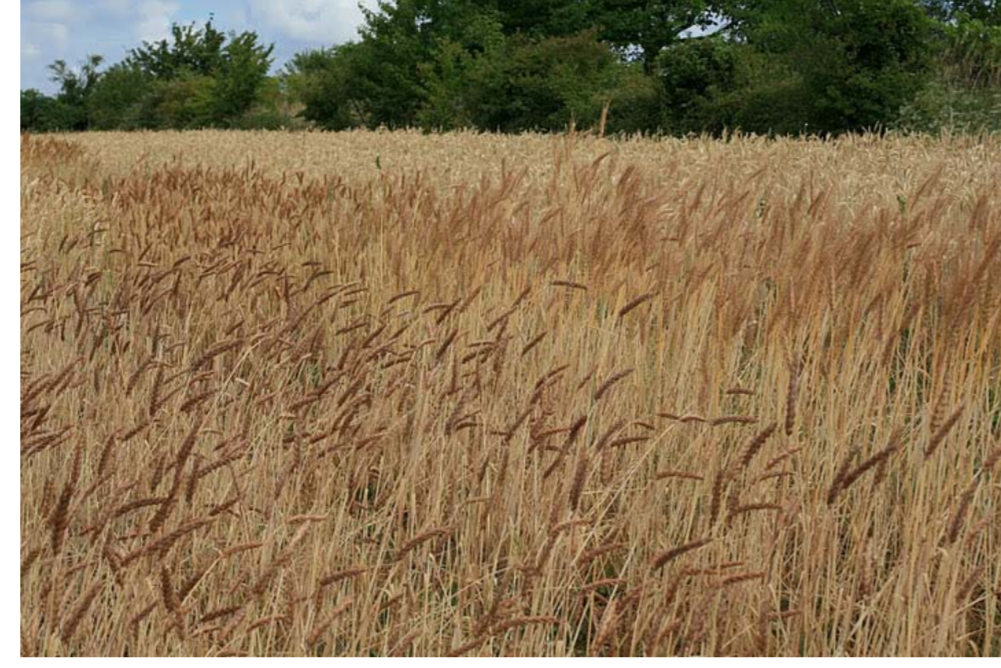
Platform at wheat maturity

✓ WP6, T6.2 - participatory plant breeding and management and developing methodologies for participatory research