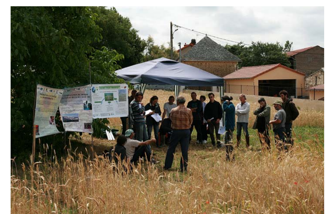
Farm day: visit of the platform with researcher and farmers