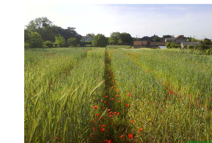
Platform at heading time