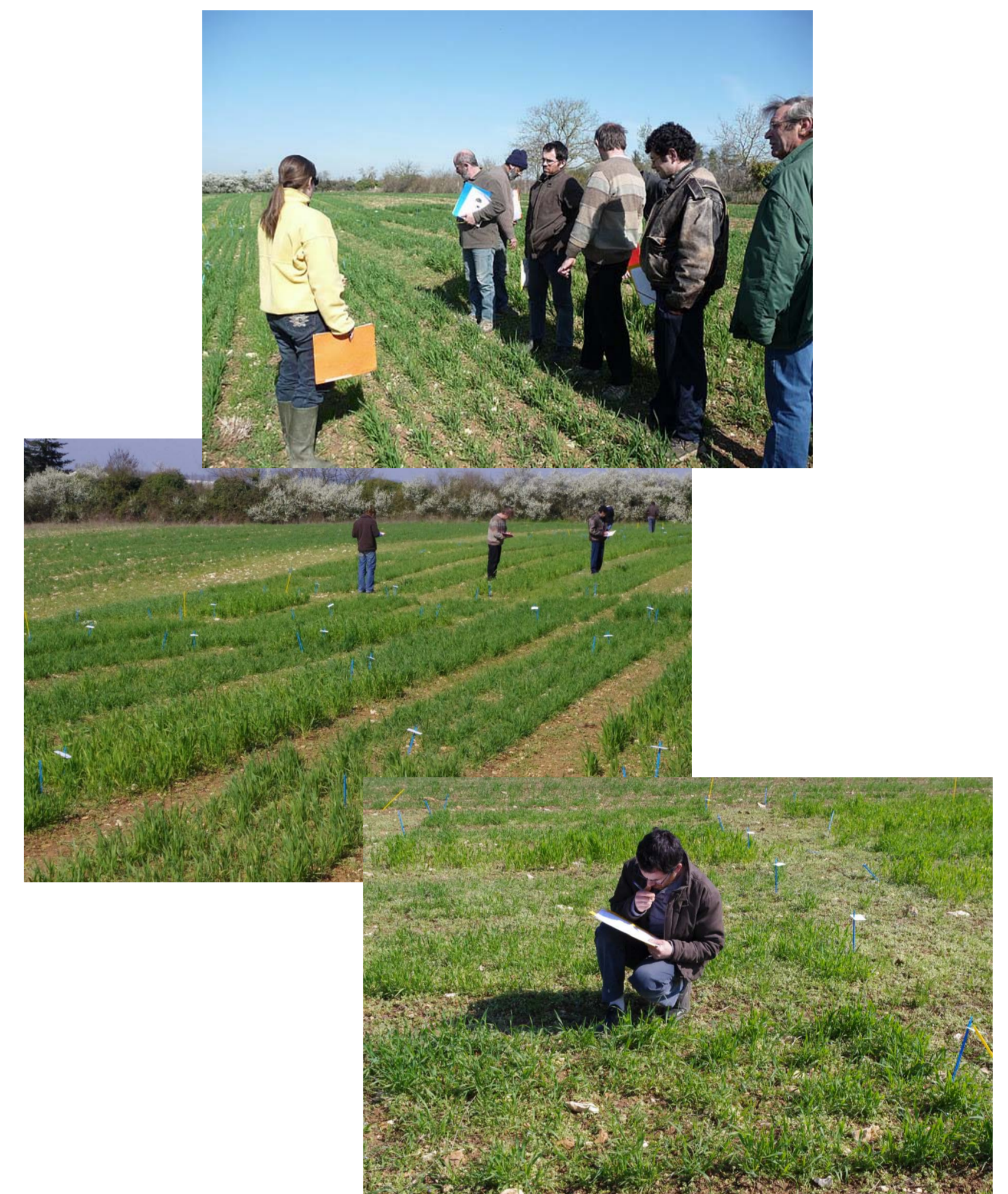
Common and individual observation of the platform

✓ One or 2 visits of 2-3 farmers will take place at spring in order to exchange on the on-going trials