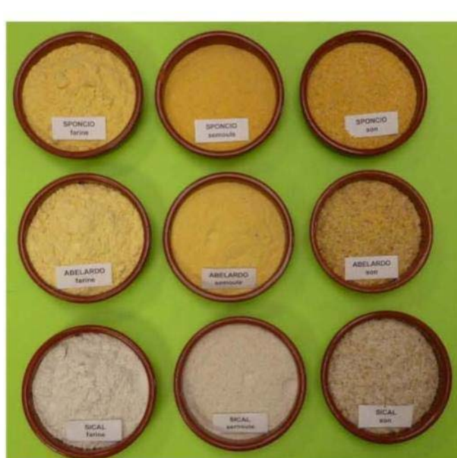
Farine, semoule et son 3 variétés différentes