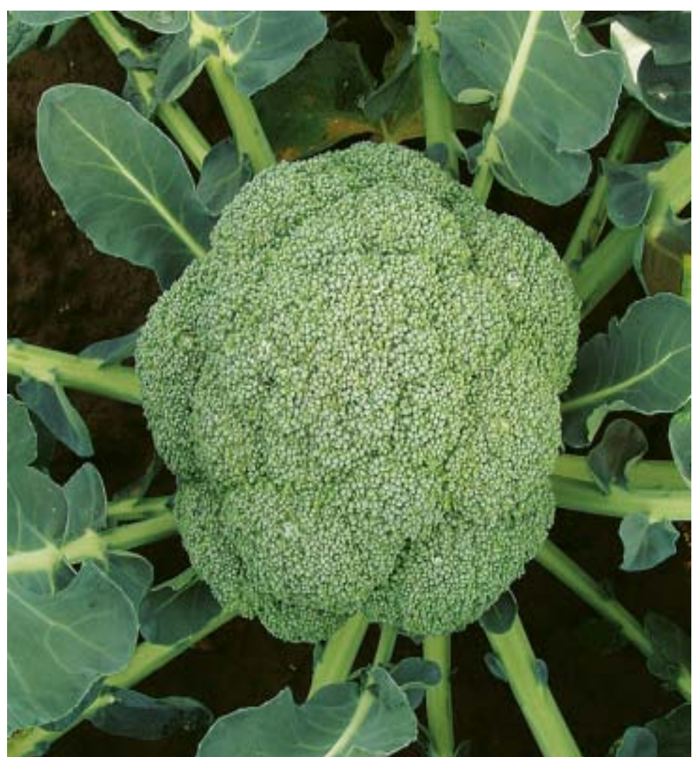
A modern variety of 'Marathon' type for its shape