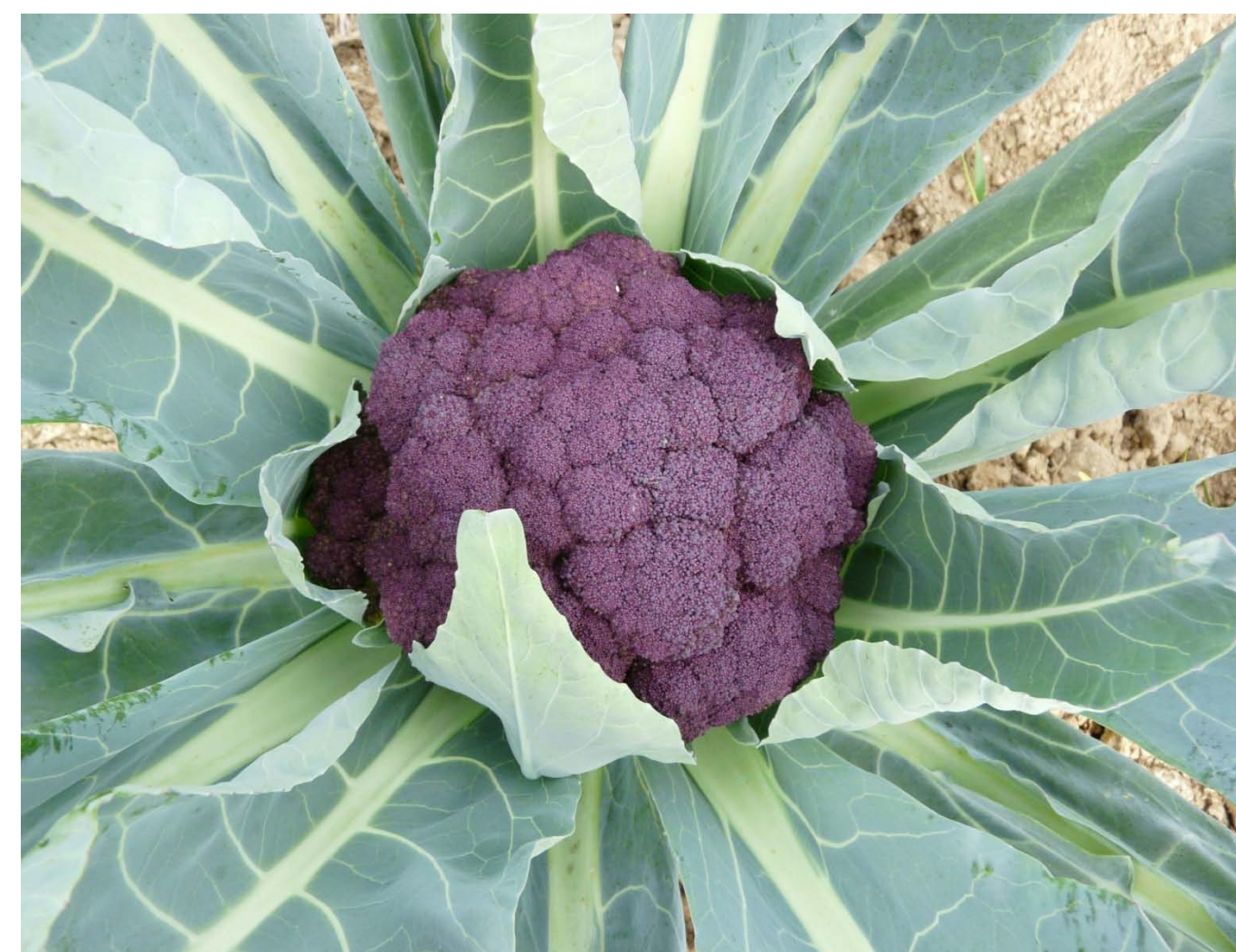
A purple variety, 'Rosalind', for its color