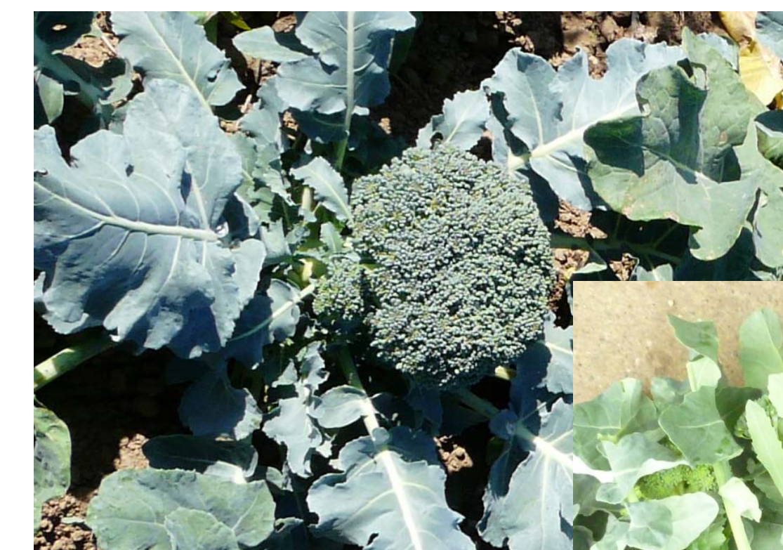
A sprout variety, 'Di Cicco', for its sweet taste