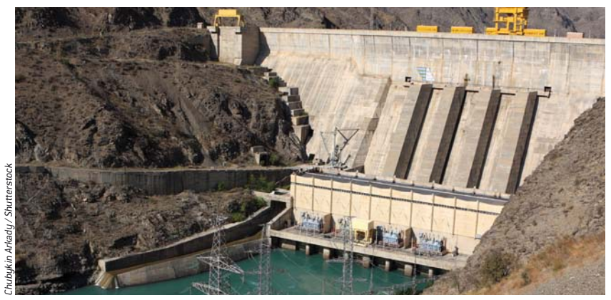
Built on the Naryn River, tributary of the Syr Darya River near the Uzbek border, Taktogul dam is the largest in Kyrgyzstan.

These new practices can nevertheless lead to increased competition