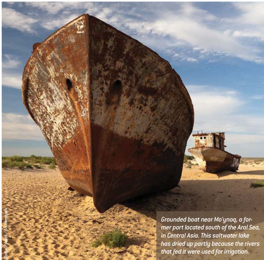
Grounded boat near Mo'ynoq, a former port located south of the Aral Sea, in Central Asia. This saltwater lake has dried up partly because the rivers that fed it were used for irrigation.

With regard to acceptance strategies, they are intended to transform urban areas susceptible to flooding, which translates into constructing on stilt systems (as, for example, in Bangladesh) or developing "floating" housing (as in the Netherlands) and to encourage farmers to relinquish certain plots of landfields to concentrate on those which are more resilient. A necessary additional requirement will be the design of different types of adapted insurance intended for farmers, which will gradually replace compensatory funds. Public reinsurance