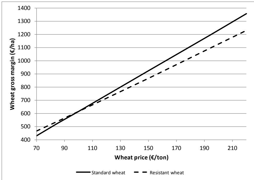
Figure 1: Evolution of the wheat gross margin with respect to the price of wheat