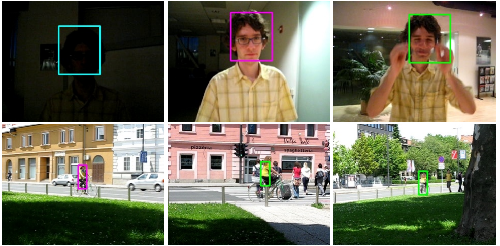
Figure 3: Illustration of our proposed framework’s tracking results on the “David”(1 st row) and “Bicycle”(2 nd row) videos. Different scene context variations in lighting, texture or background are present throughout the videos. Our framework selects the most suitable tracker in each scenario (pink: HAAR, blue: HOG, green: HOC).