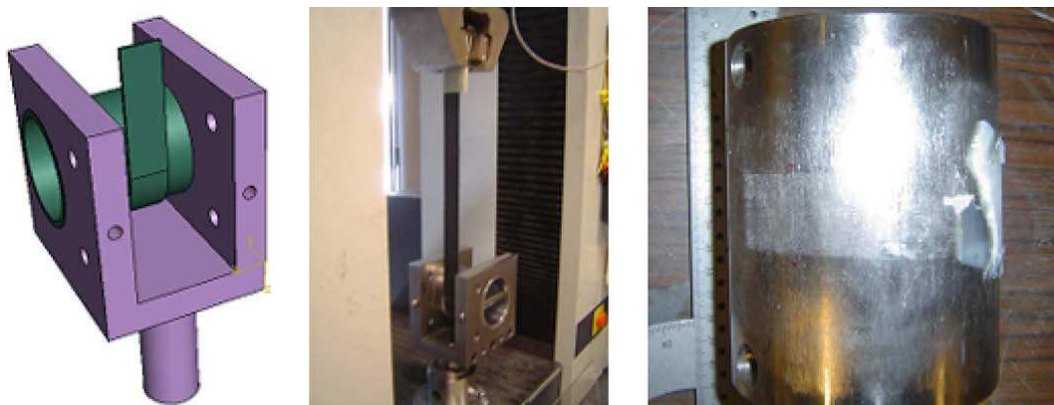
Fig. 2 - From left to right: diagram of the test device for curved joints, picture of the experimental set-up, and photograph of a specimen after fracture showing the marking of the steel by the friction zone.

A specific test apparatus, shown in Fig. 2, was designed. This can be used to test both the lap and curved assemblies while ensuring that the composite adherent remains aligned with the axis of the testing machine. A 100 kN tensile testing machine operating with a constant rate of displacement of 2 mm/min was used.