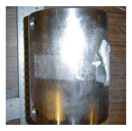
Fig. 2 - From left to right: diagram of the test device for curved joints, picture of the experimental set-up, and photograph of a specimen after fracture showing the marking of the steel by the friction zone.

Two different types of fracture were observed, cohesive fracture within the adhesive joint and tensile fracture of the strip. It is to note that after the test the steel surfaces were highly marked in the friction zone, so it is important to take this into account from the theoretical standpoint. The results of the investigations for each specimen with regard to fracture mode and capacity are reported in Table 1.