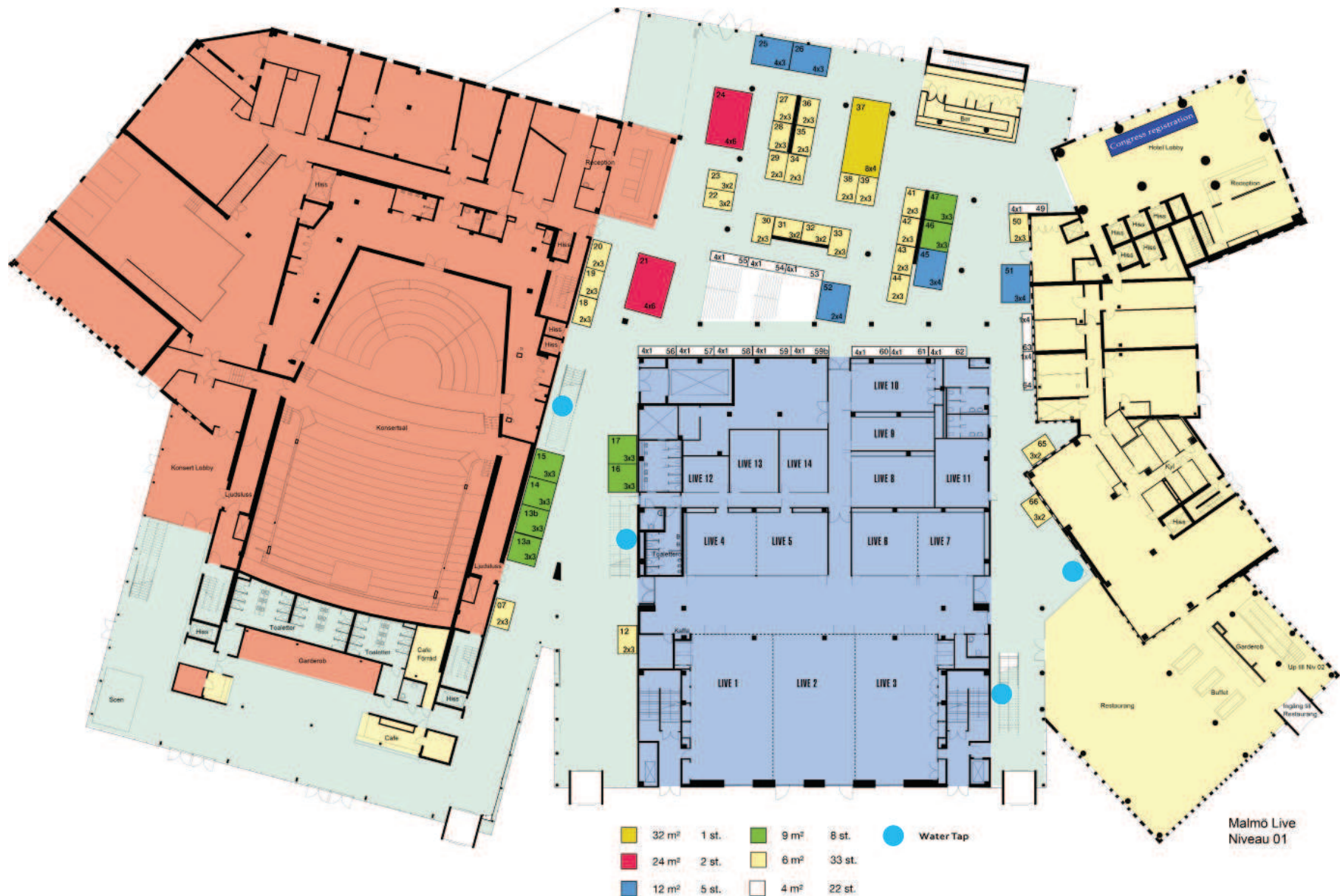
Malmö Live Niveau 01