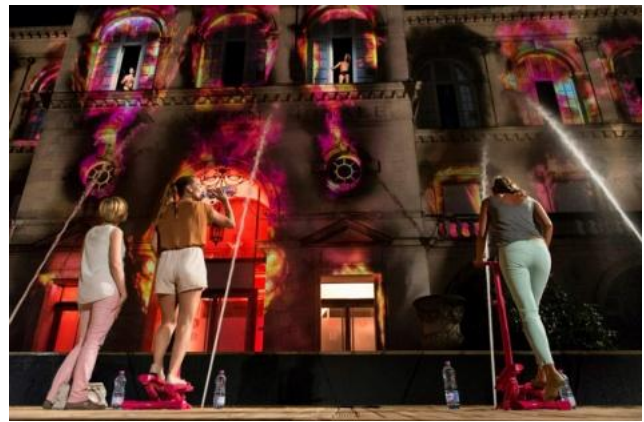
Figure 5: Contrex AD, 2012. [23]

The third example is the Contrex advertisement: some women on bikes turn on a giant neon strip-tease. This time, Contrex turned to light Paris' halls of residence, and real strip teasers in flames appeared at the windows of the building [23]. All this presented in a fun and relaxed way with this strip tease and these women burning calories (fig. 5).