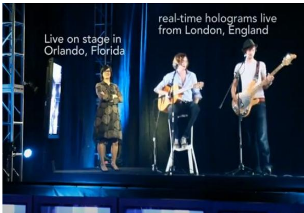
Figure 2: 3D holograms from London and Montreal to Orlando, Florida. [5]

The second is the interactive transmission process which is known as "Musion Live Stage telepresence" (fig. 2). Three Christie Roadster HD18K DLP projectors were used for the first-ever transmission of live, interactive 3D holograms from London and Montreal to Orlando, Florida in 2009 [5].