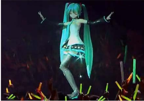
Figure 1: Miku the singing, digital avatar. © SEGA http://miku.sega.jp/ . © Crypton Future Media, Inc. © SONY Music Lable. [4].

Miku pranced around several stadium stages as part of a concert tour, where the capacity crowds waved their glow sticks and sang along 2009" [4].