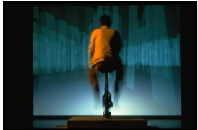
Figure 6: Jeffrey Shaw, Legible City 1989[1]. http://www.jeffrey-shaw.net/images/083_001.jpg

This experience makes us think of the first experiences in this domain and more precisely of that of Jeffrey Shaw "Legible City" in 1989 (fig. 6), in which a video projector is used to project computer generated images on a small screen at the front of a bike, the bike's handlebars and pedals allowing the spectator to interactively control their trip's speed and direction [1]. In these two examples, the physical effort produced is essential to the interaction with a video projector.