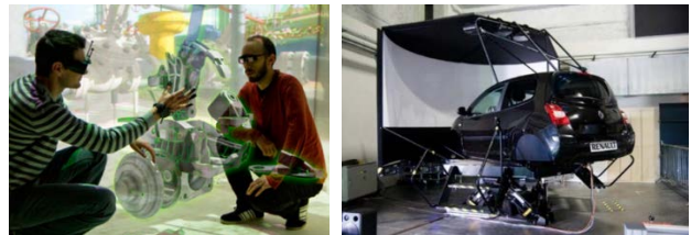
Figure 2: CAVE system (left) and dynamic driving simulator (right).