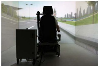
Figure 5: 3 DOF driving simulator during the experiments.

Motion sickness may appear when the field of view is recovered and the vestibular system is not excited. To study these effects during the driving in a CAVE, we conducted several experiments under 8 conditions for both static and dynamic situations at a same driving scenario (mono visual type, stereo visual type, 60 degrees of horizontal field of view in CAVE, full horizontal field of view in the CAVE).