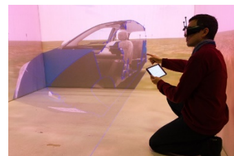
Figure 3: VARI3 allows a user to manipulate a virtual model using a tracked handheld tablet.

The Virtual & Augmented Reality Interactive and Intuitive Interface (VARI3) project is an ambitious collaborative endeavor, funded by French Government, with industry partners Renault, ON-X, Lumiscaphe, Theoris, and CEA List. Over the past two years, the partners have designed and implemented a system which incorporates a tracked handheld tablet allowing users to manipulate and travel around a virtual automobile prototype while already immersed in a traditional CAVE system, as shown in Figure 3.