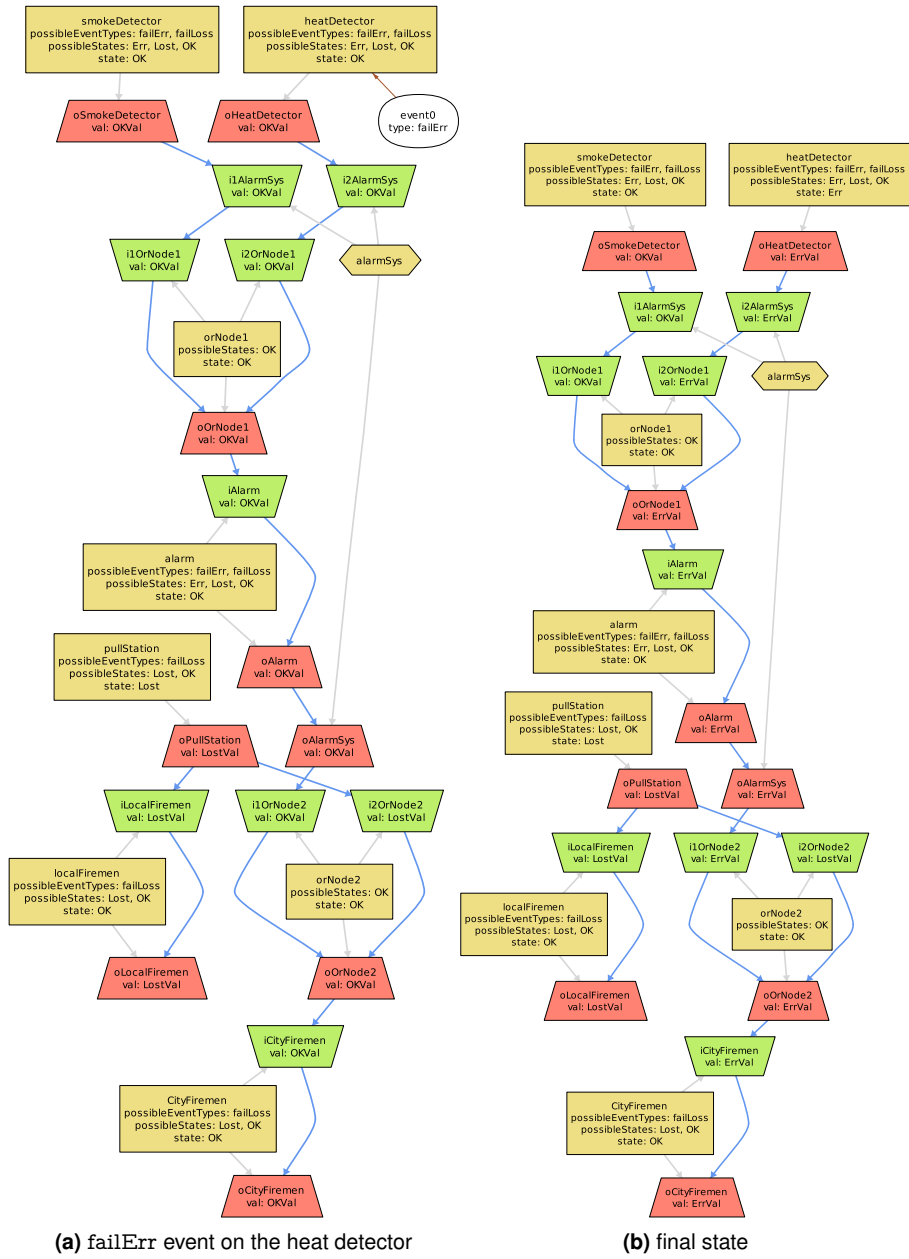
Fig. 3: Counter-example for assertion noDoubleFailureLeadsToFiremenNotOK (follow-up from Fig. 2)