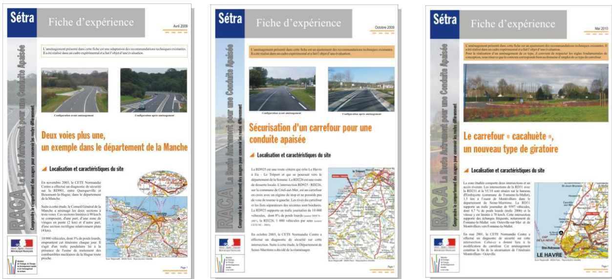
Fig. 1. RACA Feedback Sheets.