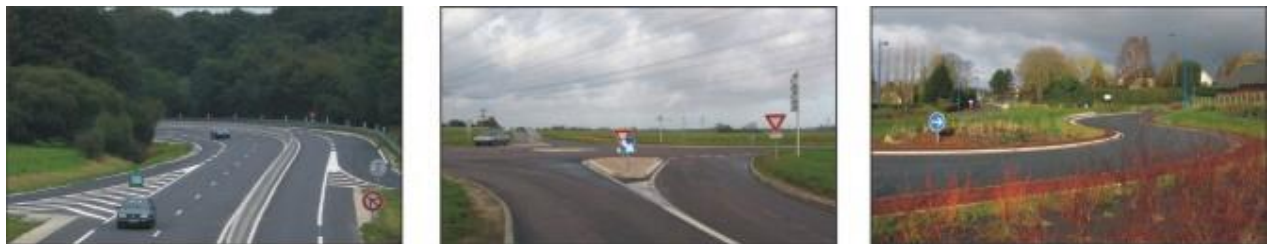
Fig. 2. Illustrations of assessed layouts: “2+1”, roundabout with median range, “peanut” crossroad (CETE NC, 2010).

Layouts are qualified according to a pre-defined approach (see Figure 3 the structure of a RACA feedback sheet):