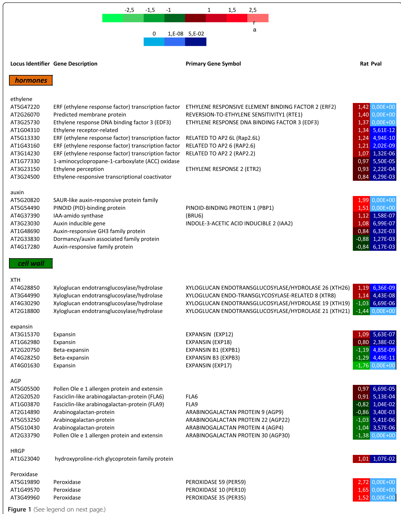
Figure 1 (See legend on next page.)