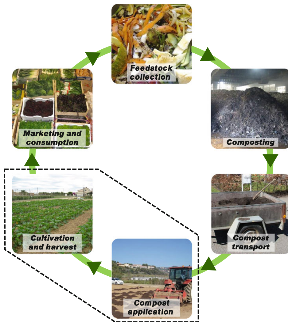
Fig. 1 Overview of the life cycle of compost production and use in agriculture. This review focuses on the environmental benefits produced from the compost application to the harvest stage