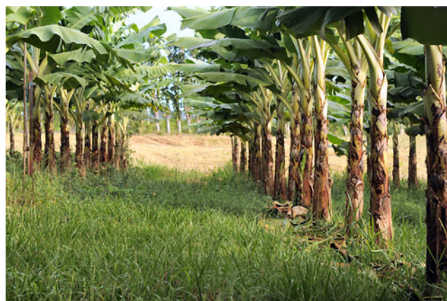
Fig. 1 Cover cropping in banana systems (Martinique, French West Indies), as most innovative cultural practices, alters the overall ecological functioning of the ecosystem including soil-plant interactions (Ripoche et al. 2012), aboveground pest regulation (Duyck et al. 2011; Mollot et al. 2012), and belowground pest regulation (Djigal et al. 2012)

Recently, food web modelling frameworks have allowed significant progress in modelling interactions between communities in ecosystems (Allesina and Pascual 2009; Caron-Lormier et al. 2009). Van Der Putten et al. (2009) asked for the model that includes linkage between above- and belowground food webs. The first use of these models will be to better understand and simulate ecological processes in agroecosystems. One of the main issues to be addressed by food web-crop models is trade-offs between regulation, conservation, and production ecosystem services. Indeed, the effect of innovative or conservation cultural practices (e.g. enhancement of plant and arthropod diversity (Fig. 1), zero tillage...) on trade-offs between regulation of crop pests