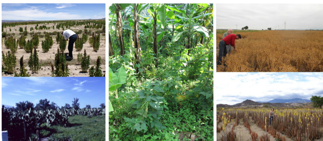
Fig. 1 Top left quinoa ( Chenopodium quinoa ) field north of the Salar de Uyuni, Dept. Potosi, Bolivia; below left field of nopales ( Opuntia ficus-indica ), State of México, Mexico; center home garden in central Uganda with plantains ( Musa paradisiaca ) and

While GM crops have received much attention and investment, traditional breeding has been focusing mostly on increasing yield (Gurian-Sherman 2009). Newer and sophisticated breeding methods using increasing genomic knowledge, but not GMO techniques, show promise for increasing yield. The large investment in the private sector indicates that research on genetically modified versions of major crops is expected to continue, while organic and other agroecological methods are not likely to attract a similar investment. This increased specialization and intensification of production systems have led to reduction in crop and livestock biodiversity, and increased genetic vulnerability and erosion (FAO 2007; Gepts 2006). It is thus hardly surprising that the 2010 biodiversity targets were not met (Larigauderie and Mooney 2010). Nearly 17,000 species of plants and animals are currently at risk of extinction, and the