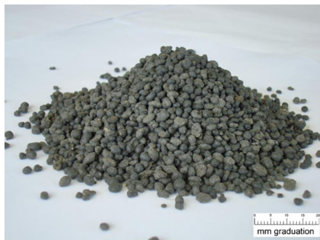
Fig. 1 Organo-mineral fertilizers shown as pellets that were used in this project

This current study focuses on the use of an organo-mineral fertilizer (Fig. 1) that overcomes problems associated with variable nutrient content and imbalances in N/P ratio in sewage sludge by combining the organic material with an inorganic coating of urea and supplement of potassium (Antille 2011). Organo-mineral fertilizers have previously been