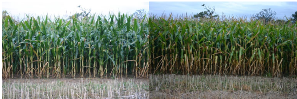
Fig. 5 Comparison of maize plots applied with organo-mineral fertilizers ( left ) and conventional fertilizer ( right ). The maize plots applied with organo-mineral fertilizer look more lush and green compared to the conventional one

As no additional P was added as part of the conventional fertilizer treatment, it must be concluded that these results reflect a higher initial residual P concentrations at this location in the field than was captured by the bulked baseline dataset. A single application of de-watered sewage sludge will supply adequate PO 4 3- for most 3–4 year crop rotations (Smith 2008).