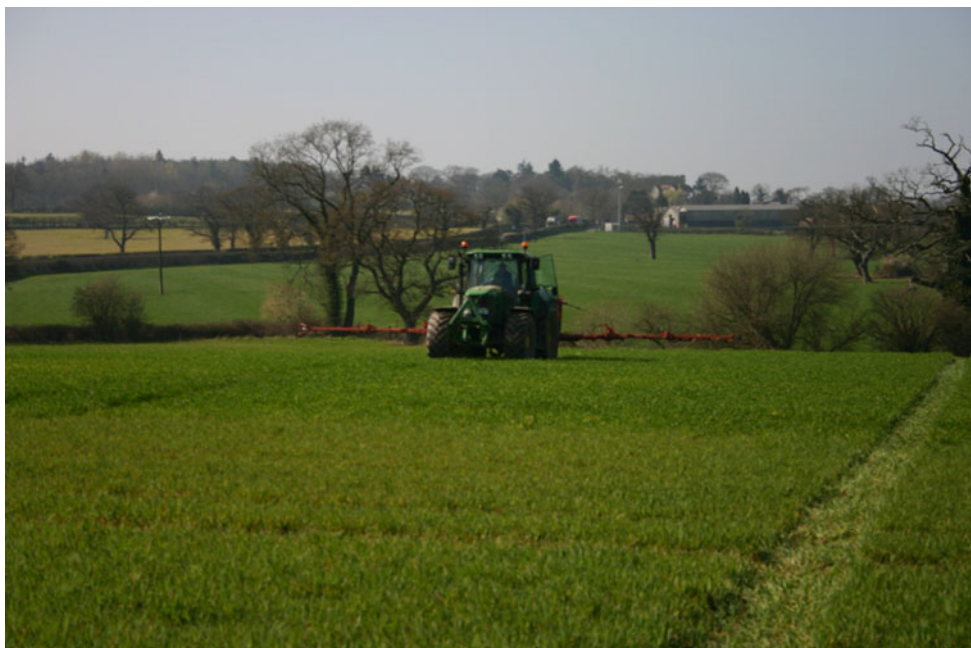
Fig. 2 Spreader applying fertilizers in plots at Broxton, Cheshire, UK

In 2008, following a winter wheat crop, 1.6 ha of a 5-ha field was marked out into 48 plot areas each 288 m 2 (Fig. 3). Prior to crop establishment, a 750-g, baseline, soil sample taken at 0–30 cm was collected from each plot area and bulked into one sample bag for soil chemical analysis using standard soil laboratory protocols (see Section 2.6). Subsequently, rotational crop systems were established in the plot areas. The rotation sequences and crop varieties chosen were typical of the geo-climatic region in which the experiment was established. This choice enabled the experimental plots to be used in demonstration events hosted for local farmers as the trial had direct relevance to their farming systems. The crop rotations included winter wheat, Einstein and Solstice ( Triticum aestivum L.); spring wheat Tybolt ( T. aestivum L.); all oilseed rape, Ability ( Brassica napus L.); winter barley Sequal ( Hordeum vulgare L.); spring beans Fuego ( Phaseolus vulgaris L.); forage maize, ES Ballade ( Zea mays L.) as shown in Table 1. The remaining field area was sown with perennial rye grass mix in 2008. The arable plots were laid out between tramlines (24 m