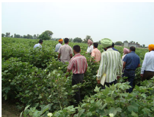
Fig. 1 Training session in insecticide resistance management farmer's cotton field. The farmers were imparted with skill training in cotton fields for observing insect pests and their natural enemies present in cotton ecosystem during the Insecticide Resistance Management (IRM)-based Integrated Pest Management program in cotton. In case of complex technologies like IPM, farmers' fields should be used as a laboratory for imparting hands-on training to farmers