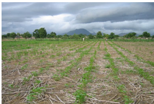
Fig. 1 Photograph of a farmer cotton field, North Cameroon, 2004. In the center, note the conservation agriculture plots and on the right part note the tilled plot with smaller plants

Three cereal/cotton rotation systems are used in North Cameroon: a conventional cropping system with tillage and two “improved” cropping systems: one using direct mulch, and the other a no-tillage system. Farmer fields were approximately 2,500 m 2 in size. The fields (Fig. 1) were divided into two or three plots and one system was used in each plot (conservation agriculture, no tillage, or tillage). In the conservation agriculture system, cotton was sown in mulch left over from the previous crop, maize, or sorghum, either grown as a sole crop or in association with a cover crop of either brachiaria ( Brachiaria ruziziensis ), crotalaria ( Crotalaria retusa L.), or mucuna ( Mucuna pruriens Bak). On tillage plots, the soil was plowed to a depth of 15 cm with an ox-drawn plow. Cotton was sown with a hoe to cause minimum disturbance of the soil surface. The cotton cultivars used were those available to local farmers (IRMA 1239 and IRMA BLT-PF). Weeds were controlled by hoeing and herbicides were applied. Pests were controlled according to the conventional plant protection program.