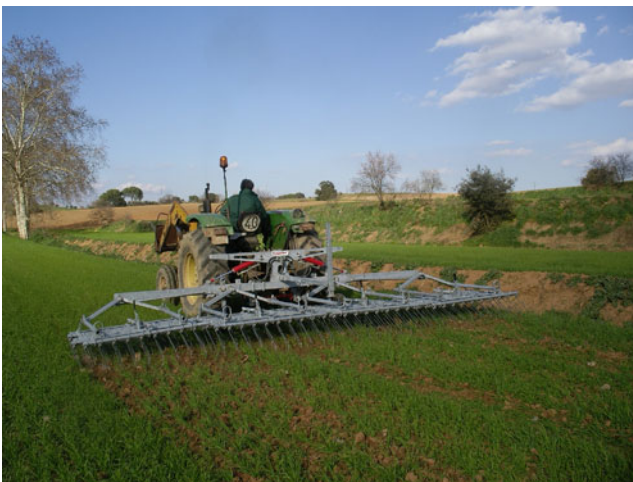
Fig. 1 Organic farmer using a weed harrow. Most organic farmers use weed harrows as a direct physical method to control weeds. Weed harrows till the soil surface, uprooting and/or covering the weed seedlings with soil

The farmers' interest in alternative methods, such as mechanical and cultural weed control, has partially increased due to concerns about herbicide use and to the growing demand of organic products. Weed harrowing with flex-tine harrows is one of the most widely used mechanical methods for weed control in organically grown cereals (Fig. 1). They till the soil surface, uprooting and/or covering weed seedlings with soil. However, weed control remains a major concern for organic farmers and a perceived obstacle for the conversion towards organic farming (Sumption et al. 2004). Organic fields usually harbour higher levels of weed infestation than conventional ones (Romero et al. 2008), probably because mechanical weed control commonly achieves lower control effects than herbicides (Lundkvist 2009). Indeed, some studies have reported a poor efficiency of weed harrowing in terms of weed reduction (Ryan et al. 2010; Ulber et al. 2009). Weed harrows could therefore favour the maintenance of weed diversity and, in turn, of the ecosystem services, but they will not be a feasible method for organic producers unless they minimises crop losses to an economically acceptable level.