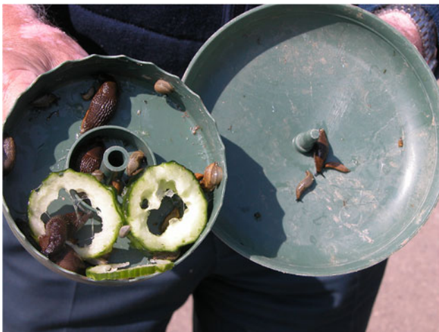
Fig. 1 Slug trap with slugs and cucumber slices

The slug numbers of the eight traps per transect were summed for the analyses and referred to as slug activity density. Slug data of the two sampling periods per year were pooled because we were interested in the annual effect rather than in individual dates. Slug numbers were log-transformed to meet the assumptions of the performed regressions (normal distribution and homogeneity of residual variance). Data were analysed with linear mixed regression, and inferences on the variables were obtained using likelihood ratio tests. Region, field margin type, habitat and year were fixed factors, while crop type was a random factor. Tukey's post hoc test was used to analyse differences between groups. All statistical tests were performed using