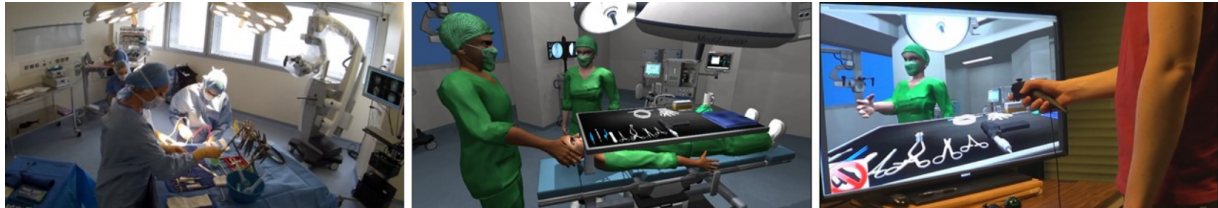
Figure 1: Our Role Model is integrated in a Collaborative Virtual Environment for Training in neurosurgery procedure.

Guillaume Claude †,1 , Valérie Gouranton ‡1 and Bruno Arnaldi §1 INSA de Rennes, IRISA/INRIA, Rennes, France