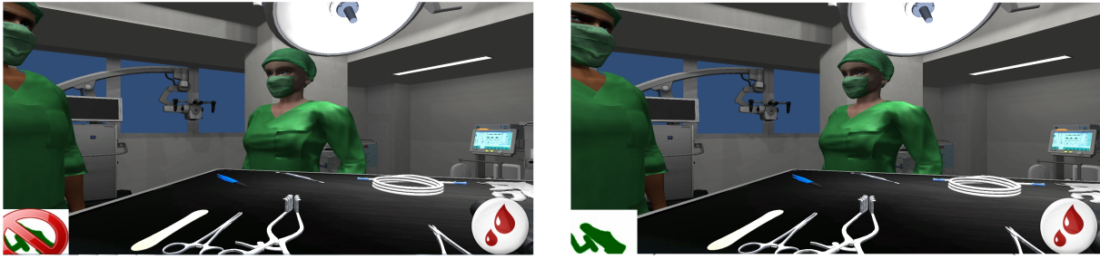
Figure 5: During the cauterisation, the actor (here the user) can push or release the pedal to trigger the Bi-polar pliers. However, he or she must not execute it before the leader has given the order. This difference is the result of the use of the attributes describing rights held by the actions and the reactive behaviour of the team structure giving the right to the user when the surgeon announces the right keyword.

uses the definitions of the actors and the actions' attributes to provide sets of actions specific to each actor. The attributes of the actions provide more specific data than any other existing model such as rights, abilities, resources and weightings. The model is also reactive. It makes the roles evolve depending on the events occurring in the environment or the unfolding of the scenario based on the rules defined by the team organisation of the actors. The simulation can be modified by providing other team organisations and other initial actors definitions.