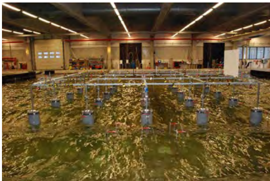
Fig. 1. View from behind the wave generator of 25 WECs.

In the research project WECwakes (Stratigaki et al. 2014), funded by the EU FP7 HYDRALAB IV programme, experiments have been performed in the Shallow Water Wave Basin (width x length: 35x25 m) of DHI, on large farms of floating devices. WEC farms of both rectilinear (Fig.1) and staggered configurations have been tested.