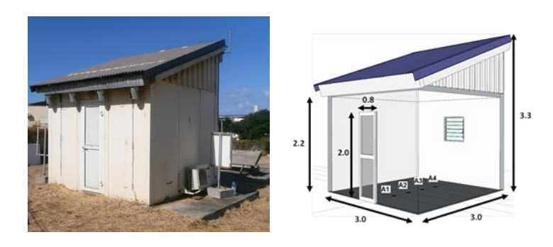
Fig. 1. Picture and sketch of the test cell.

Experiments done on the LGI cell allowed the comparison of simulated daylight values with those measured experimentally. Measurements of internal illuminance were made four points (A1 to A4), 0.01 m above the floor. The sensors were aligned to the central axis of the building (cutting the glazing into two symmetrical parts) and perpendicular to single glazing plane (glazing pane shown obstructed on the left part of previous figure was unobstructed when indoor measurements were made). They are placed in alignment with the openings on the slab as shown also in Figure 1. These sensors are equidistant from 0.5 m. The horizontal distance between the first sensor (A1) position and the opening is 0.73 m. The measurements presented in Figures 2 (global, direct and diffuse radiation) and 3 (indoor illuminance) were taken during the day of 10 February 2008, with overcast sky. Longer sequences and discussion are available in [11].