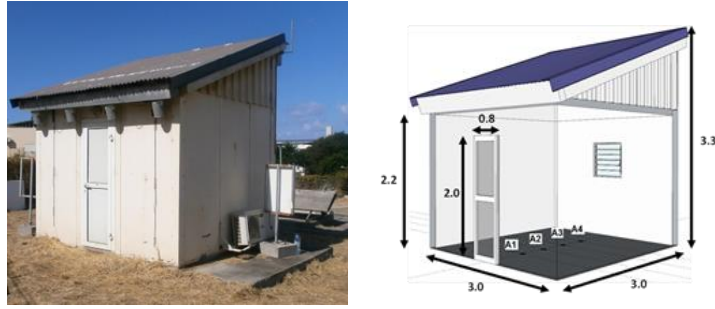
Fig. 1. Picture and sketch of the test cell.

Experiments done on the LGI cell allowed the comparison of simulated daylight values with those measured experimentally. Measurements of internal illuminance were made four points (A1 to A4), 0.01 m above the floor. The sensors were aligned to the central axis of the building (cutting the glazing into two symmetrical parts) and perpendicular to single glazing plane (glazing pane shown obstructed on the left part of previous figure was unobstructed when indoor measurements were made). They are placed in alignment with the openings on the slab as shown also in Figure 1. These sensors are equidistant from 0.5 m. The horizontal distance between the first sensor (A1) position and the opening is 0.73 m. The measurements presented in Figures 2 (global, direct and diffuse radiation) and 3 (indoor illuminance) were taken during the day of 10 February 2008, with overcast sky. Longer sequences and discussion are available in [11].