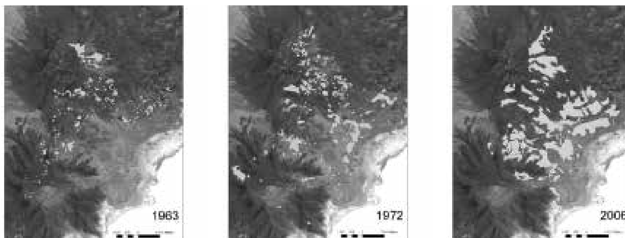
Figure 2: Expansion of cultivated areas between 1963 and 2006 in a community in the southern Altiplano of Bolivia.

decreased by 16–32% on mountainsides (Medrano Echalar et al. , 2011). This expansion has led to the uniformization of the agricultural landscape. There are vast monocultures of quinoa and fallow plots while the native vegetation – grasses and bushes that make up the tola – is increasingly relegated to marginal, rocky land or mountainsides that cannot be worked by machines (Michel, 2008).