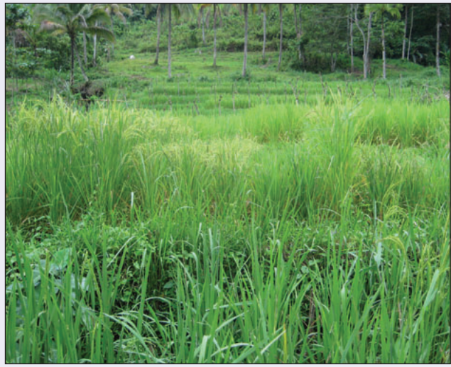
Figure 3. Garden of a MASIPAG rice cultivator in the Philippines. This garden contains 84 rice varieties and offers a seed bank for the farmers in the village.

other services from agro-ecosystems that contribute to human well-being. In a food systems context, procedural justice can be characterized in terms of food sovereignty, which Patel (2009) described as calling for “new political spaces to be filled with argument... a call for people to figure out for themselves what they want the right to food to mean in their communities, bearing in mind the community’s needs, climate, geography, food preferences, social mix, and history”, and “the building of a sustainable and widespread process of democracy”. Allowing people to understand and engage in their food choices very likely will improve the sustainability of food systems, because people would be empowered to take control of their own lives – a key objective of sustainability (Panel 2; Lyons et al. 2001).