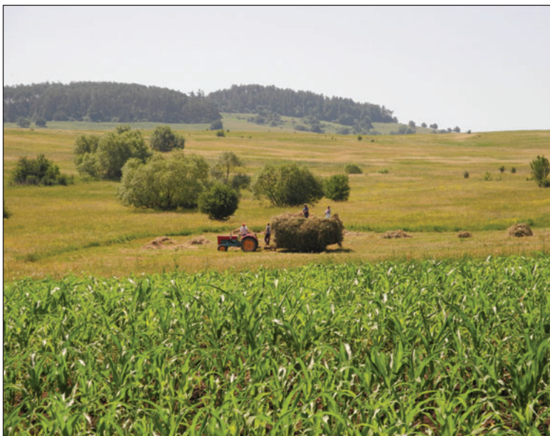
Figure 1. A landscape in Transylvania, Romania. In this region, intensification is possible because of the presence of yield gaps, but it would undermine the long-term provision of other ecosystem services such as carbon storage and the build-up of nutrient pools. Intensification very likely would not benefit those in need of greater food security.

In its current mainstream use, sustainable intensification is poorly integrated with a broader set of documented strategies to improve food security. Many authors advocating sustainable intensification acknowledge the im-