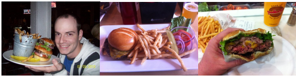
Fig. 3: Example images within class "hamburger" of ETHZ Food-101. All these images have strong selfie style as they are uploaded by consumers. Although some background noise (human faces, hands) are introduced in images, it ensures images out of food categories are excluded from this dataset.