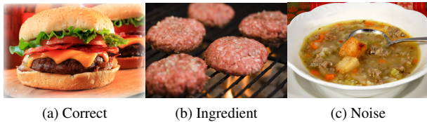
Fig. 2: Example images within class "hamburger" of UPMC Food-101. Note that we have images completely irrelevant with hamburger like Figure 2c, as well as hamburger ingredient like Figure 2b, which depends on the specific application to judge whether it is noise or not.