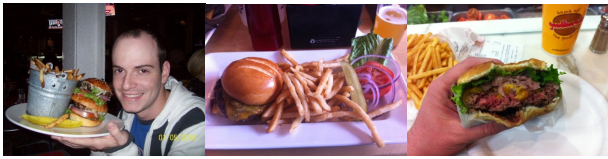
Fig. 3: Example images within class "hamburger" of ETHZ Food-101. All these images have strong selfie style as they are uploaded by consumers. Although some background noise (human faces, hands) are introduced in images, it ensures images out of food categories are excluded from this dataset.