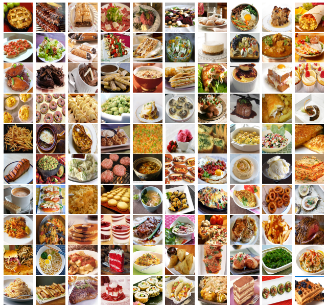
Fig. 1: Category examples of our UPMC Food-101 dataset.

We then collect the first 1,000 images returned for each query and remove any image with a size smaller than 120 pixels . In total, UPMC Food-101 contains 101 food categories and 90,840 images, with a size range between 790 and 956 images for different classes. Figure 1 shows representative instances of all 100 categories. Due to no human intervention in grasping these data, we estimate that each category may contain about 5% irrelevant images for each category. 3 examples of "hamburger" class are shown in Figure 2. We notice that adding the keyword "recipes" results in taking into account ingredient or intermediate food images. Determining whether these images should be considered as noise or not, directly depends on the specific application. Additionally, we save 93,533 raw HTML source pages which embed images. The reason that we don't have 101,000 HTML pages is that some pages are not available. The number of the images that have text is 86,574.